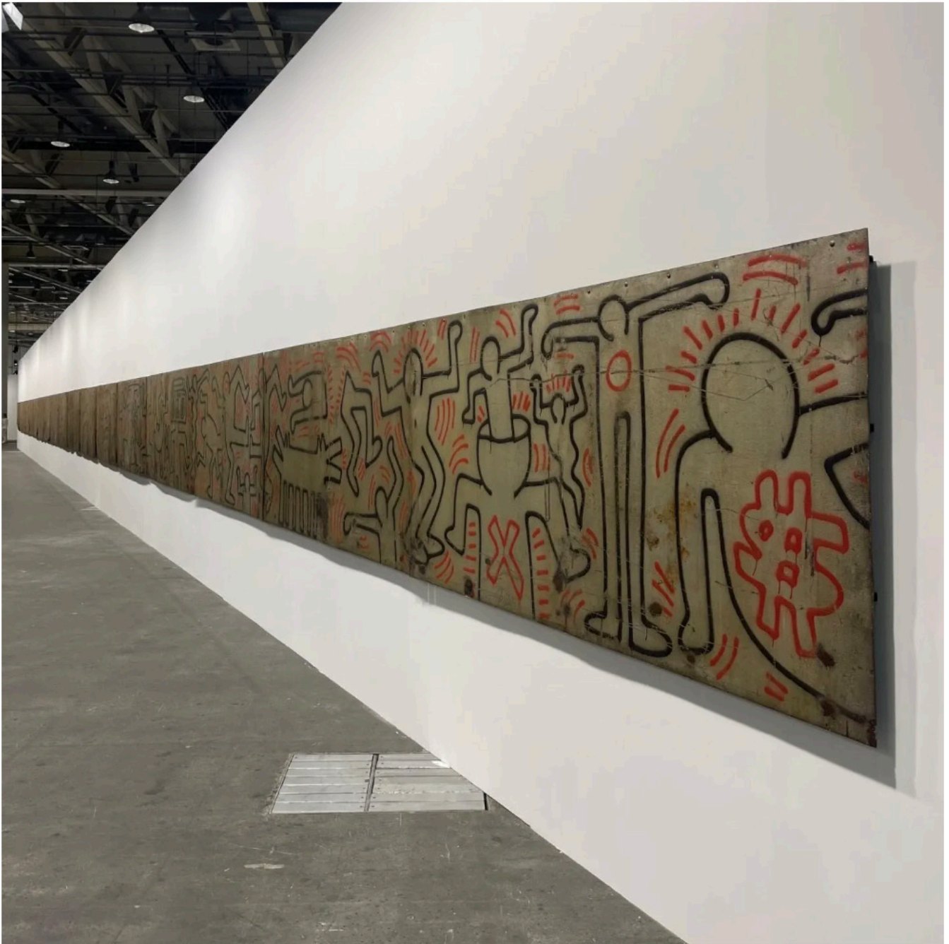
Keith Haring, Untitled (FDR NY) #5-22, 1984