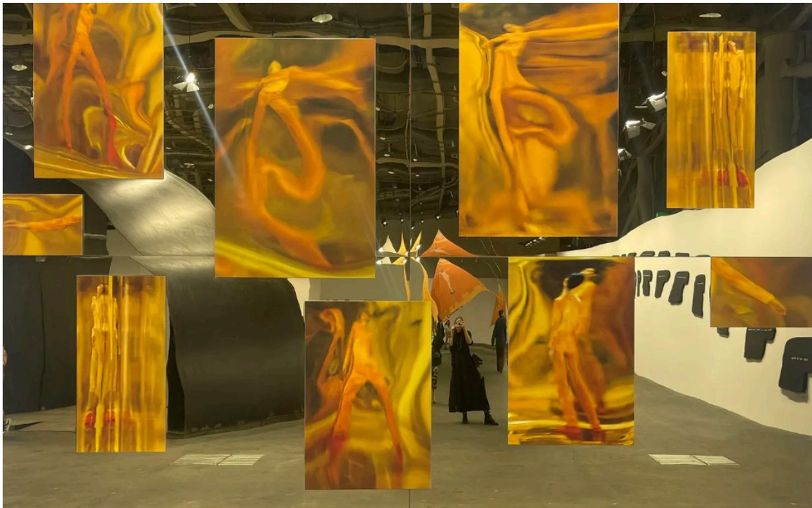
Art Basel Unlimited, Maria Hassabi, Mirrors 2024, The Breeder Gallery NEL-OLIVIA WAGA

Art Basel's Unlimited 2024 is a unique sector dedicated to large-scale projects, giving exhibitors the platform to showcase monumental installations, colossal sculptures, boundless wall paintings, comprehensive photo series and expansive video projections.