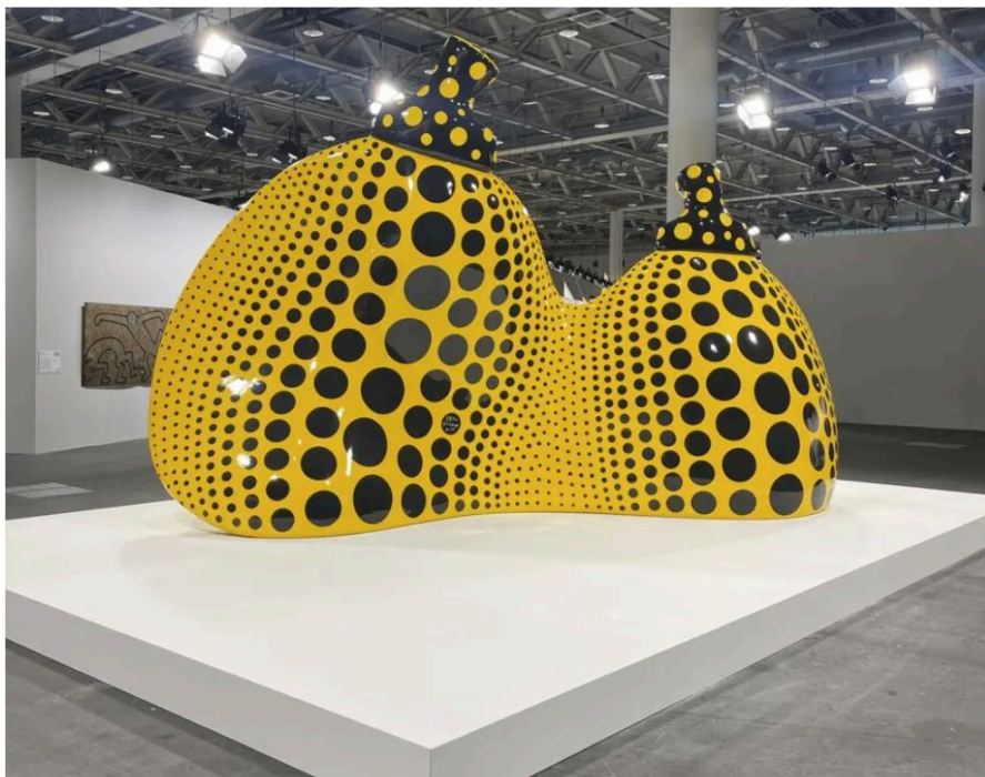
Yayoi Kusama, Aspiring To Pumpkin's Love, The Love In My Heart, 2023 NEL-OLIVIA

Yayoi Kusama's "Aspiring to Pumpkin's Love, the Love in My Heart" is a striking example of her signature style, featuring a monumental bronze pumpkin adorned with characteristic dots. This piece, part of her 2023 series, transforms the pumpkin into an undulating, almost surreal form. Kusama's work, which bridges the microscopic and macroscopic, invites viewers to engage with the sculpture from multiple perspectives, revealing a dynamic interplay of space and form. A central figure in Pop art and Minimalism, Kusama's latest creation continues her exploration of organic shapes and patterns, offering a deeply immersive and visually captivating experience.