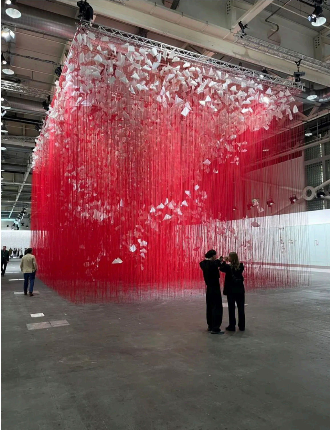
Chiharu Shiota, The Extended Line, 2023-2024

Julio Le Parc, Zepelin de Acero , 2021, Galleria Continua