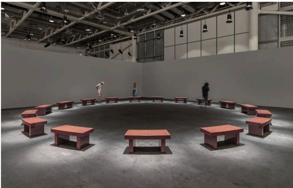
Jenny Holzer, Survival , 1989 HAUSER & WIRTH

Jenny Holzer's "Survival" series, first exhibited at the Guggenheim Museum in 1989, remains a poignant and powerful commentary on contemporary existence. Featuring 17 granite benches engraved with assertive and often contentious phrases, this installation challenges viewers to confront the harsh realities of survival in modern society. Holzer's use of text in public spaces, from electronic signs to carved stone, engages the audience in a dialogue about social and political issues. This installation, arranged in a precise circumference, not only honors its original presentation but also invites viewers to reflect on the enduring relevance of Holzer's incisive and thought-provoking messages.