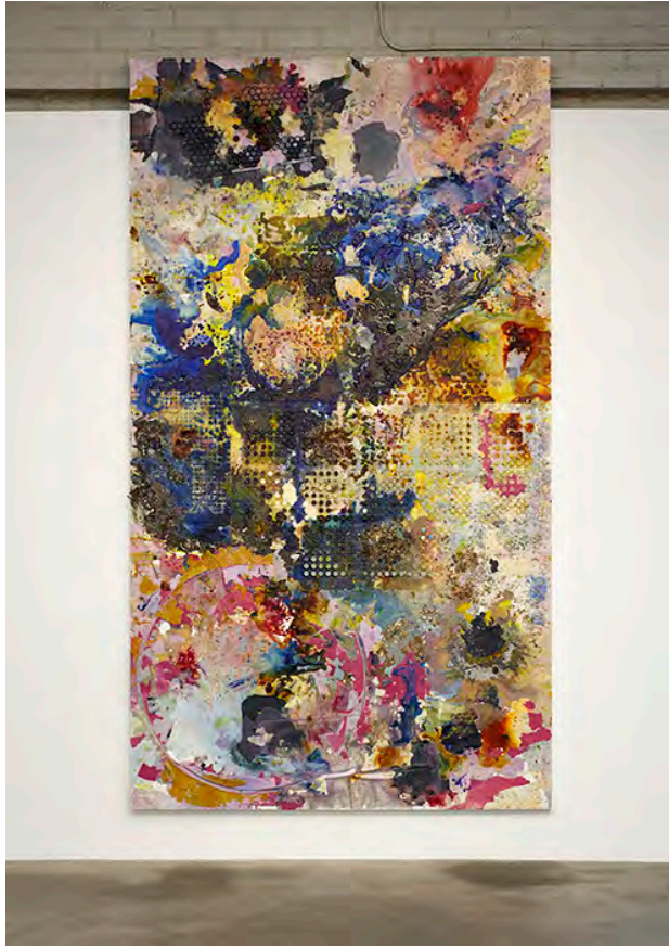
JPW3, Marco Polio Portfolio , 2014. Wax and ink on canvas, 81 x 144 inches.