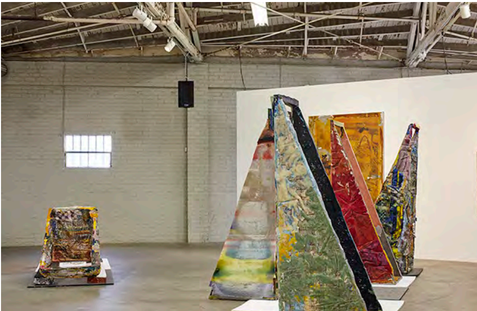
View of JPW3's "32 Leaves, I Don't the Face of Smoke," Night Gallery, Los Angeles, 2014.