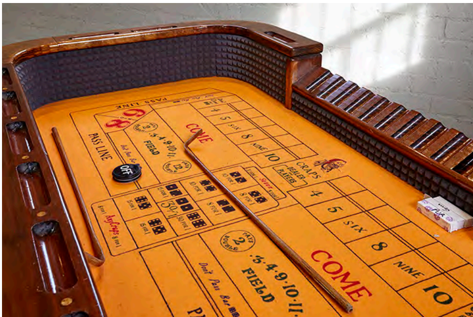
JPW3, ZZ Craps , 2014. Wood, felt, and ink, 43 1/4 x 79 1/2 x 41 1/2 inches.